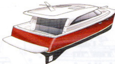
The Aspen 39 ProaCat™ — a revolutionary breakthrough in multihull design (patent pending).

The biggest 39 available —nearly 800 sq. ft. of living space. That's 40% more room than most monohulls. Better than catamarans, too. No cut-up layouts, awkward living spaces or narrow staterooms. The salon and galley are on one level along with 24' of open entertaining space. A cruising couple and their guests have king and queen staterooms with en suite shower and head. There's comfort at sea as well with a smooth, gentle, dry ride.