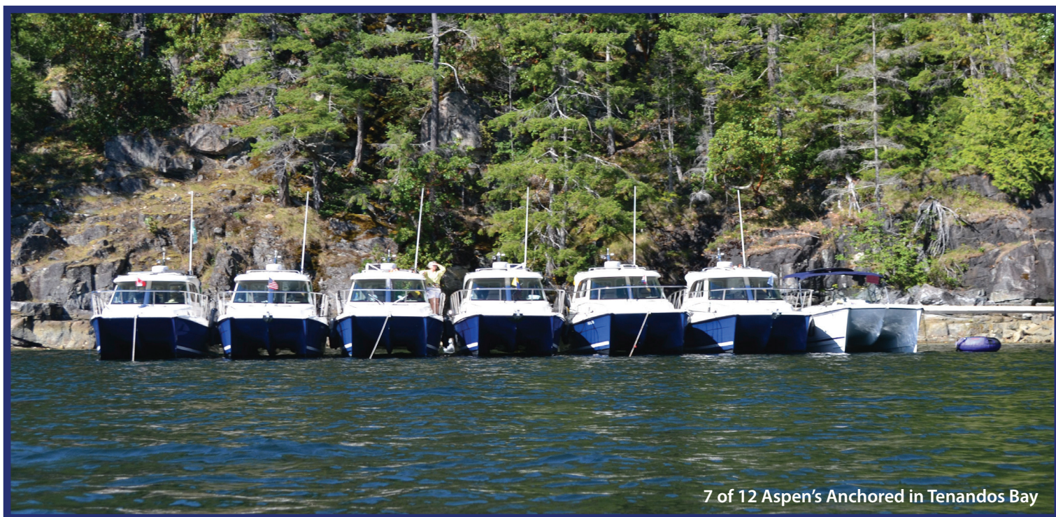
7 of 12 Aspen's Anchored in Tenandos Bay