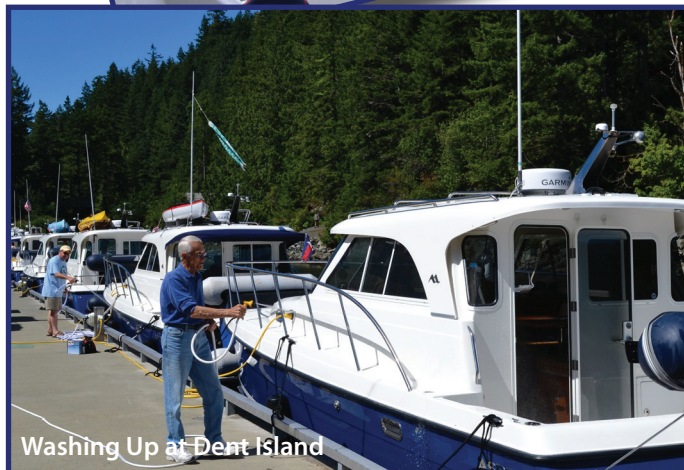
Washing Up at Dent Island