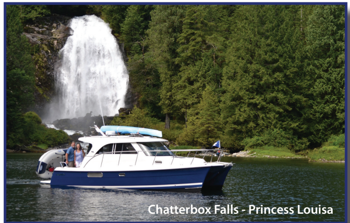
Chatterbox Falls - Princess Louisa