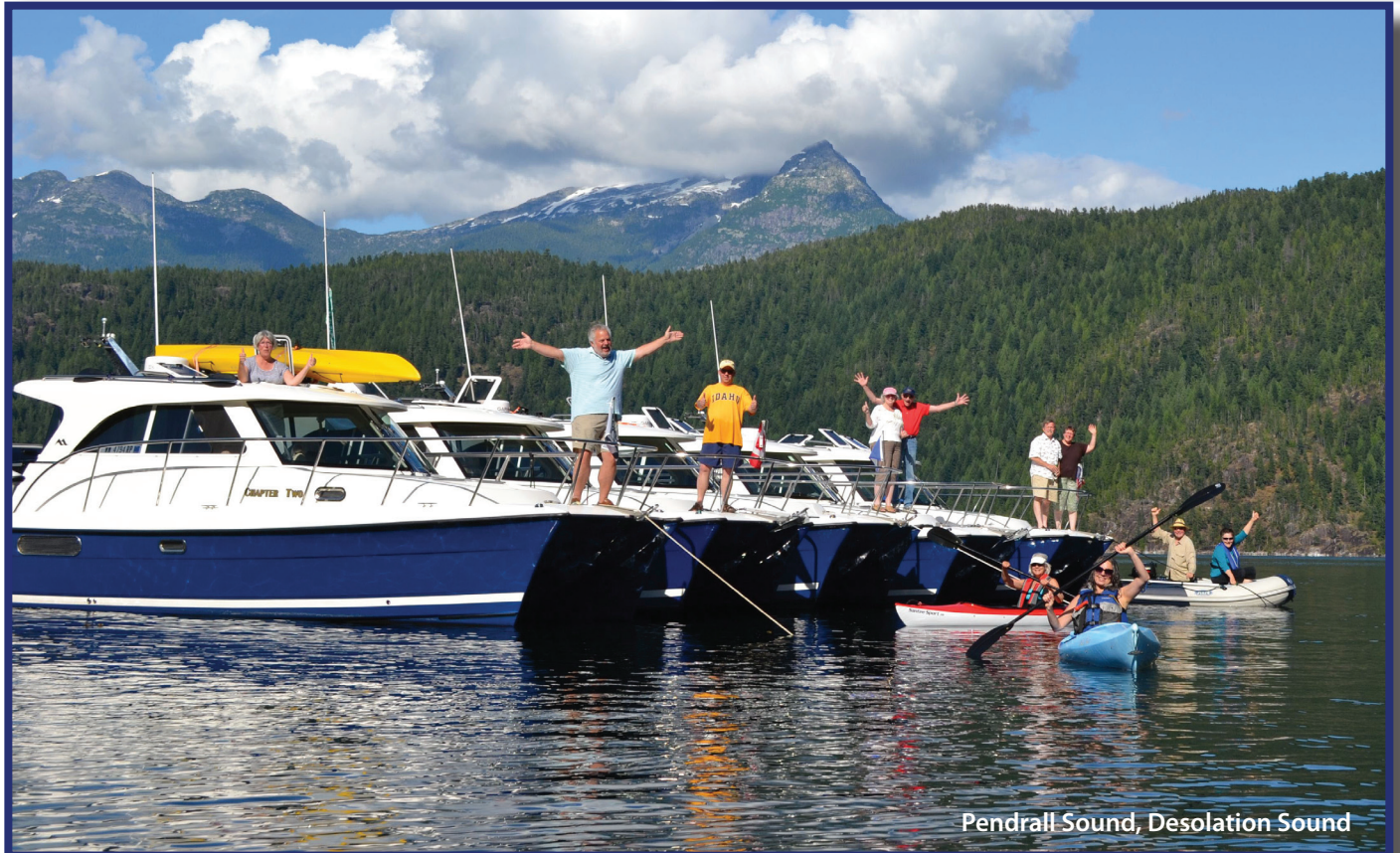
Pendrell Sound, Desolation Sound