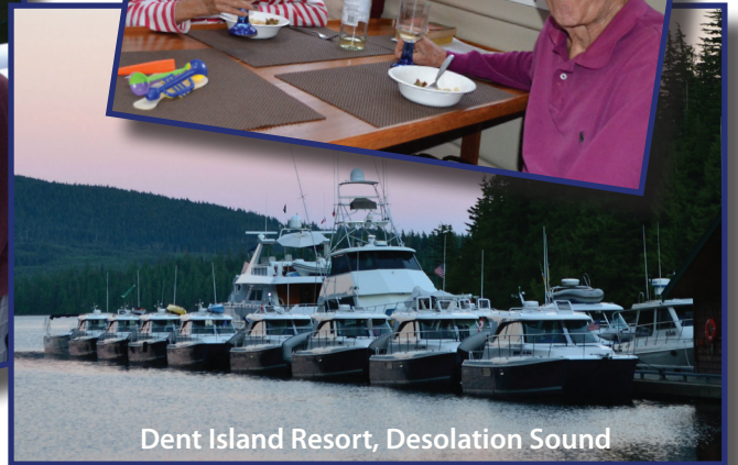
Dent Island Resort, Desolation Sound