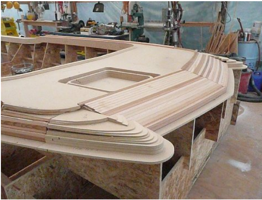
Deck Plug a few days in