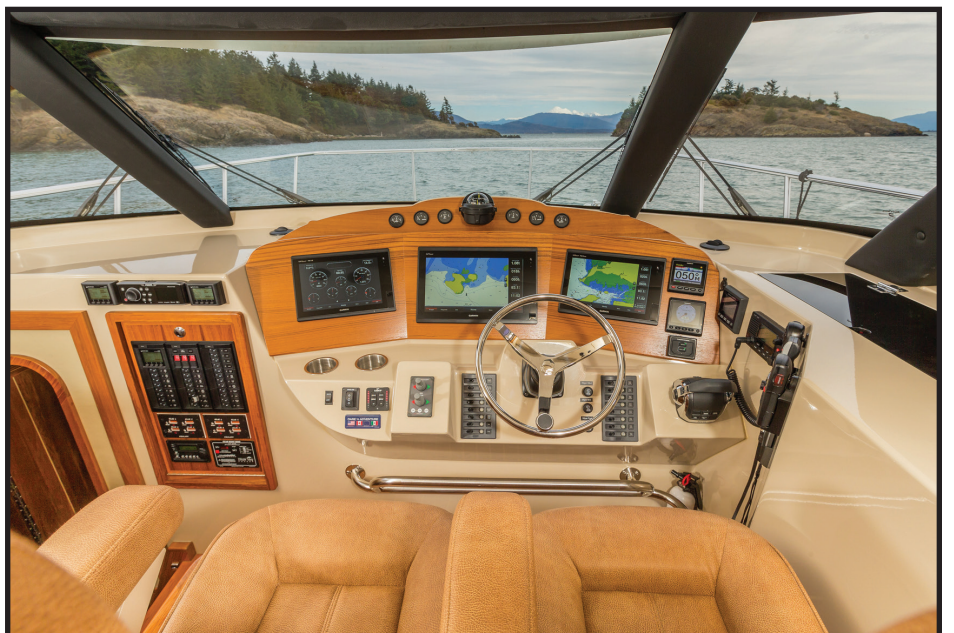
New Custom Dash Layout