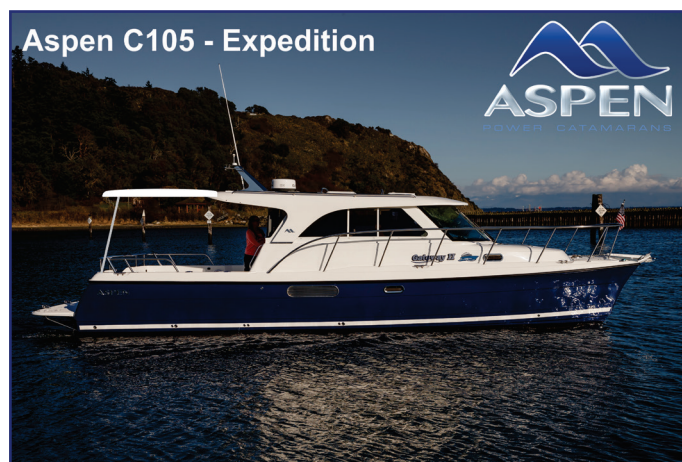
C105 - 32'