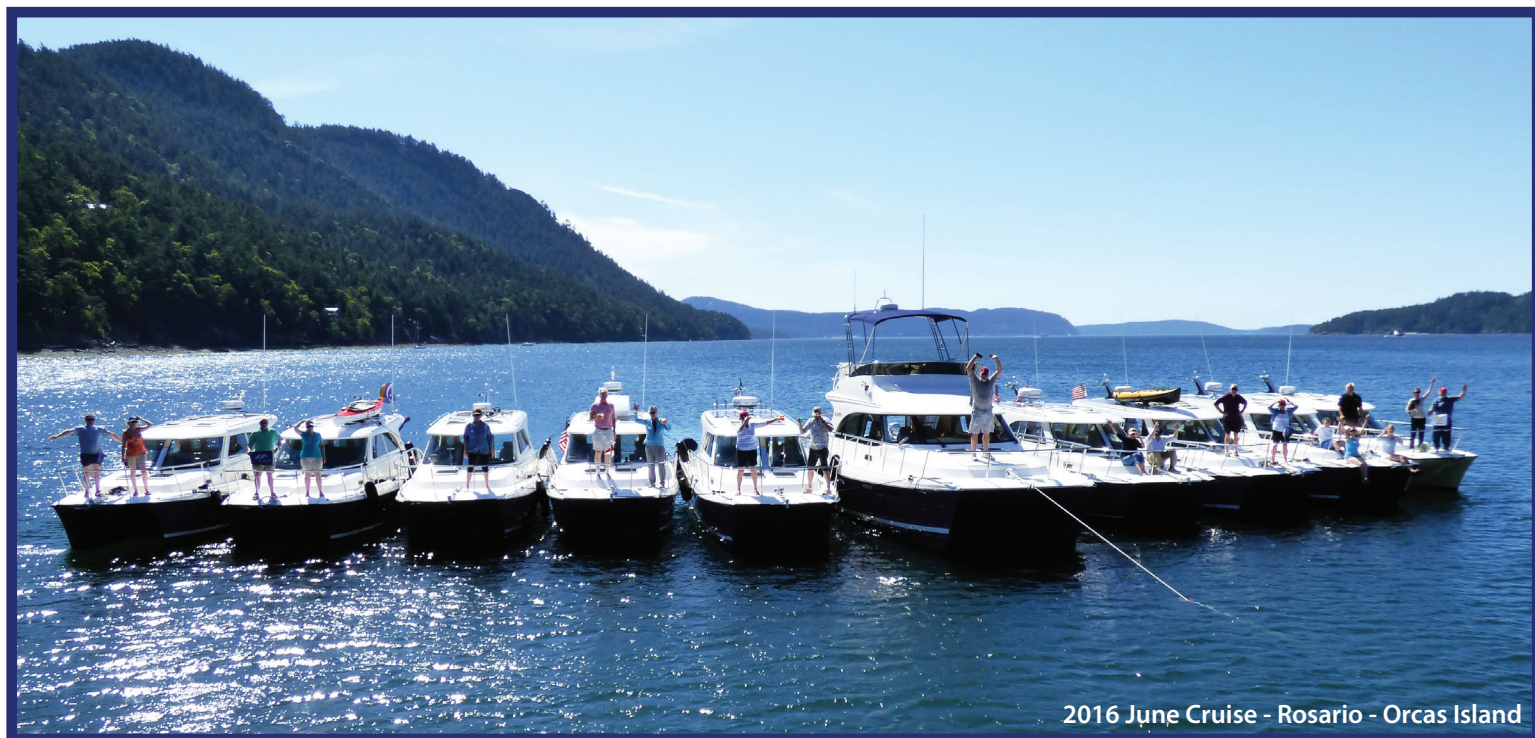
2016 June Cruise - Rosario - Orcas Island