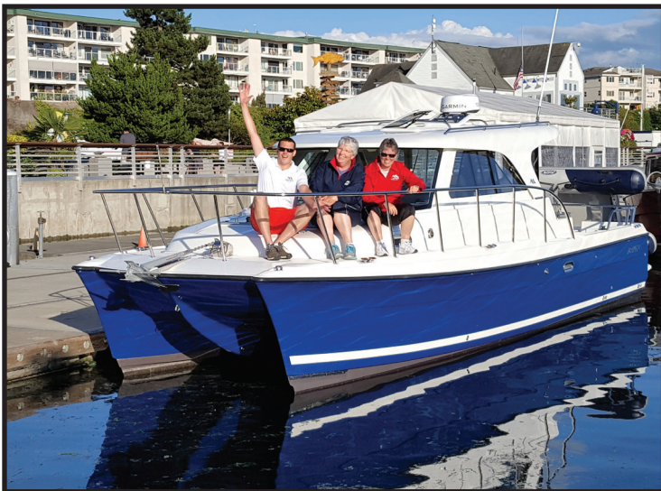
Scout, C105/32' - Des Moines, WA