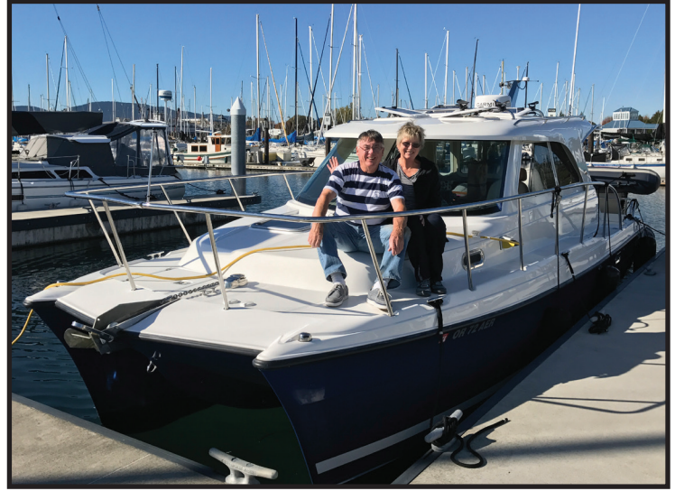
Cat Ballou, C90/32' - Washougal, WA