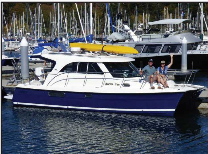
Gradely, C90/28' - Virgin, UT