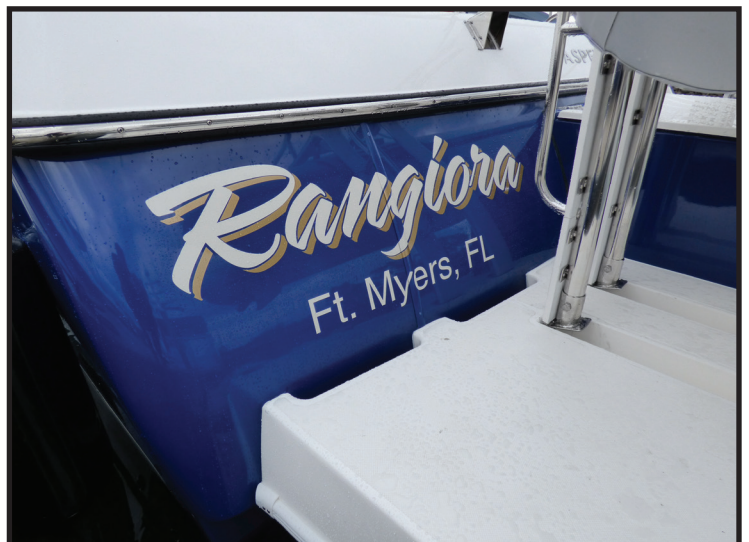
Rangiora, C120/40' - Ft. Myers, FL