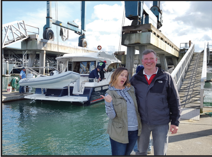
Mohana, C120/40' - Seattle, WA