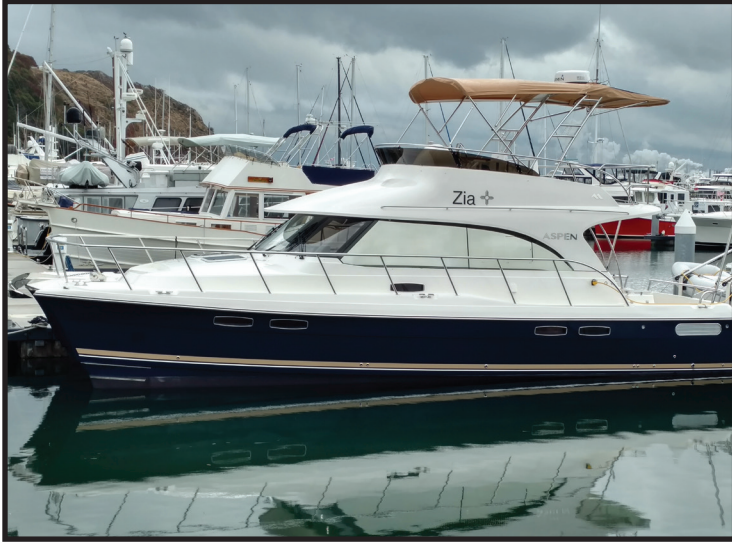
Zia, C120/40' - Issaquah, WA