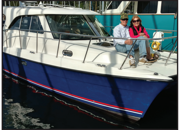
Larapin Times, C100/32' - Port Townsend, WA