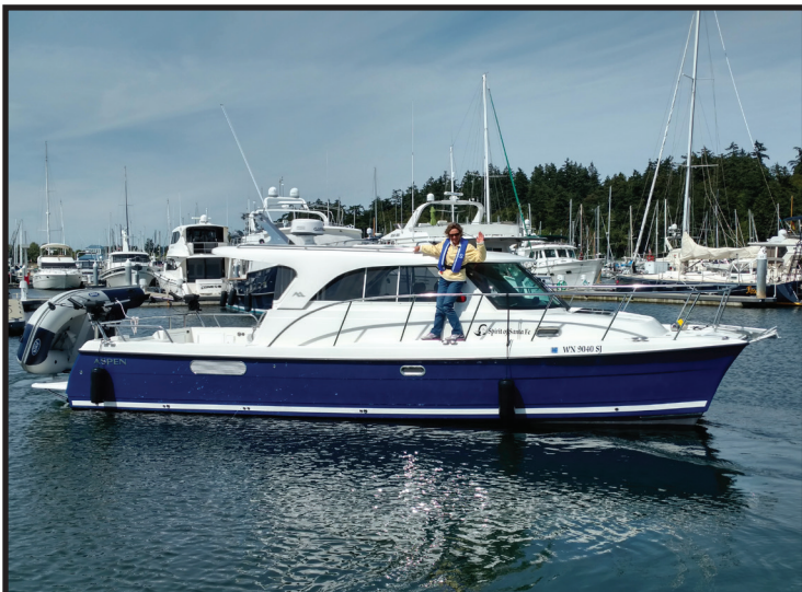
Spirit of Sante Fe, C100/32' - Friday Harbor, WA