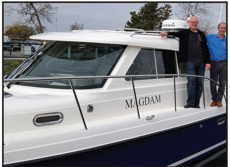
Magdam, C100/32' - Port Moody, B.C.