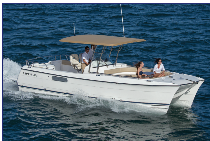
L90LX - 28'

206.948.5090 - nick@aspenpowercatamarans.com