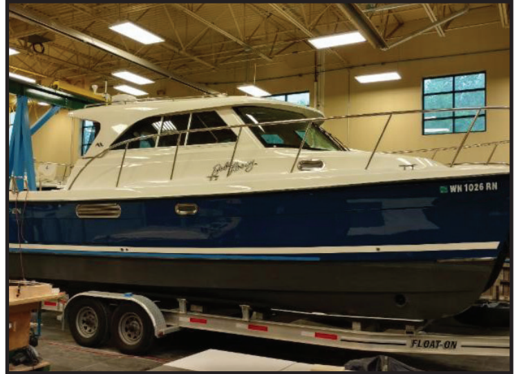
Baba Looley, C100, 32' - Bainbridge Is., WA