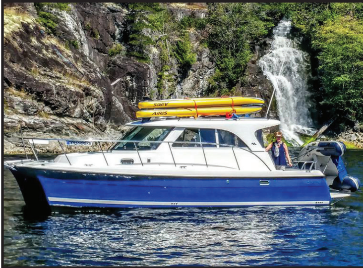
Graceful, C90/28' - Seattle, WA