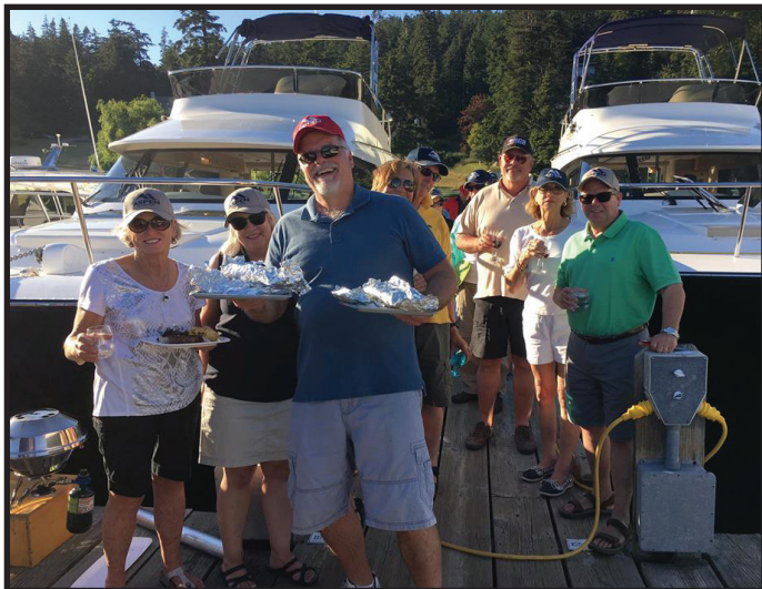
Barbecue - Potluck

Aside from boat building and nine boat shows, we had two wonderful owner's cruises. The first was to Rosario on Orcas Island, during a warm sunny June weekend. Then in July/August a two-week cruise to Princess Louisa and Desolation Sound. At the high point, we had 14 boats, a wonderful and memorable trip with Aspen owners. Finally, this last month we had our annual Christmas Party with our owners at Larry and Cathy's. The house was beautifully decorated, with an amazing dinner including king salmon and chicken marsala. It was a fabulous evening, complete with slot car track races and a slide show of last season's cruises. For 2017, the team will be going to Victoria in early June and, water levels allowing, Harrison Lake up the Frazier River in late July, early August.