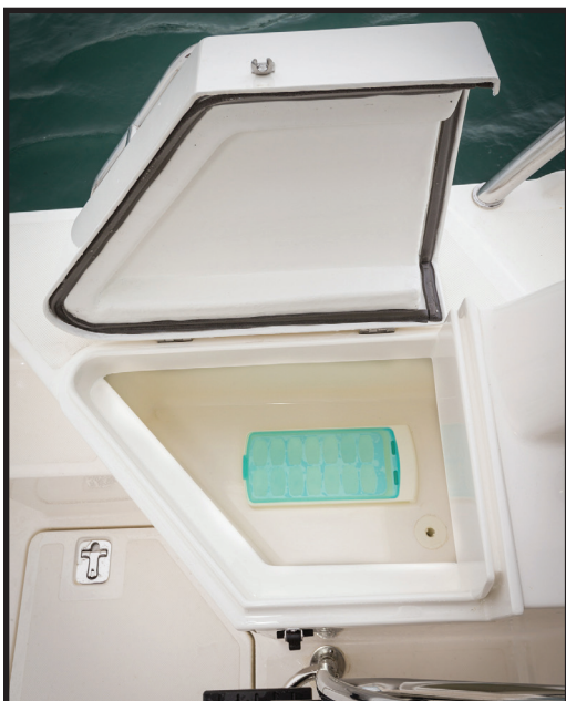
New Custom Built Insulated Ice Box, Replaces Cockpit Sink

Zia also includes an update to the galley and quarter berth that gives 20% more overhead space and a smoother look in the ¼ berth overhead. She also has a new forced-air heating system that utilizes two Wallas Heaters; a 30d in the starboard companion way and a 40d in the transom just forward of the swim platform, inside the cockpit storage box. The new heaters have a history of exceptional reliability, fast heat and are very quiet in operation. With two heaters, the owners also have the flexibility to run just one if they wish. The heaters we used in the past were Hydronic and while they had in years' past been reliable, the company redesigned the unit for safety and created so many fail safe systems that the units often were locked in safe mode.